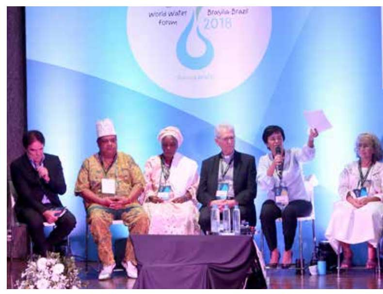
Spiritual leaders discuss the link between water and spirituality during a dedicated session, 22 March.

A meeting of religious and spiritual leaders was organized on World Water Day during a session named 'Water and Spirituality: An Encounter with the Sacred'. This special session aimed to strengthen the sacred bond between water, spirituality and human life, culminating in the presentation of a <u>Water and</u> <u>Spirituality Declaration</u>. The declaration promotes a spiritual and transdisciplinary outlook on water in which the spiritual and sacred aspects of water are examined through religious, philosophical and humanistic lenses. The main idea advocated by the declaration is that water can favor peaceful coexistence by uniting people of different ethnicities, traditions, religions and cultures, while respecting and caring for the natural and spiritual cycles of water. Indeed, sustainability is not only a concept promoted by a specific group; it is an ethical commitment to the respect for life.