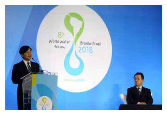
Crown Prince of Japan Naruhito delivers his keynote address during the high-level panel 'Improving Disaster Risk Readiness', 19 March.

igh-level political leaders gathered at the 8<sup>th</sup> World Water Forum to raise awareness, discuss improvements in science and technology and encourage the mobilization of sufficient financial needs to tackle water-related disasters and their consequences. Among the political leaders were the President of Hungary, the Crown Prince of Japan and the Minister of Natural Resources and Environmental Conservation of Myanmar.