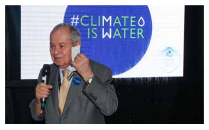
Vice-President of the World Water Council Doğan Altınbilek during a special evening reception on the Council booth, 21 March.

Meeting national climate adaptation and mitigation targets cannot be done without considering water within national, regional and international planning. Hence, interested parties are encouraged to work towards integrating water as a strong component of mechanisms such as the Nationally Determined Contributions (NDCs) and the National Adaptation Plans (NAPs). As a longterm goal, it is hoped that water issues will be integrated and addressed in all political and technical levels and discussions.