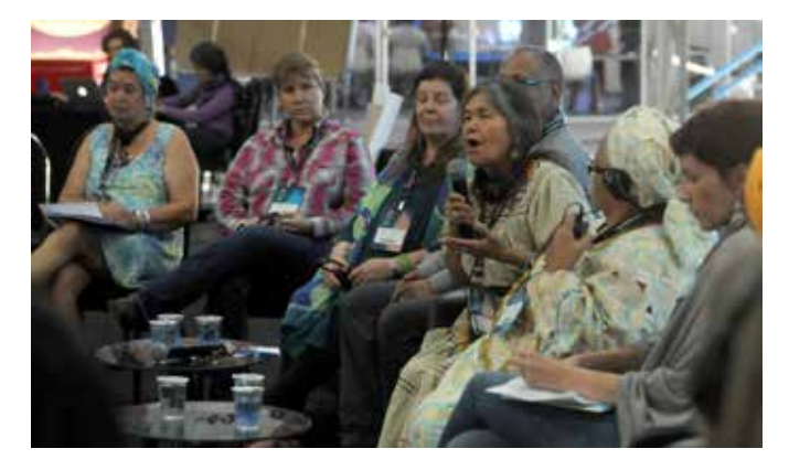
Women engage in a debate during a roundtable on indigenous communities as guardians of water, 22 March.

The Citizens Forum also produced a "<u>10 Principles Document</u> of the Citizens Forum", containing not only the legacies that will remain as part of this process, but also the new narratives and ideas evidenced by the participants of the Citizens Process. This document emphasizes ideas around sharing, the integrity of ecosystems, water cultures and encouraging broader participation in decision making.