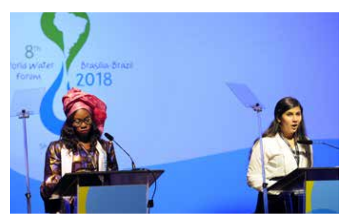
Youth Delegates present the Sustainability Declaration during the Forum Closing Ceremony, 23 March.

A sanovel outcome of the World Water Forum, the <u>Sustainability</u> <u>Declaration</u>, read out during the closing ceremony of the 8<sup>th</sup> World Water Forum, called for the urgent mobilization of all parties to ensure a future in harmony with the environment. To do so, the declaration advocates that the UN, governments and societies should consider water as a core element in achieving sustainability. It also requests that the UN High-level Political Forum on Sustainable Development helps build cooperative alliances, water reforms and financial innovations.