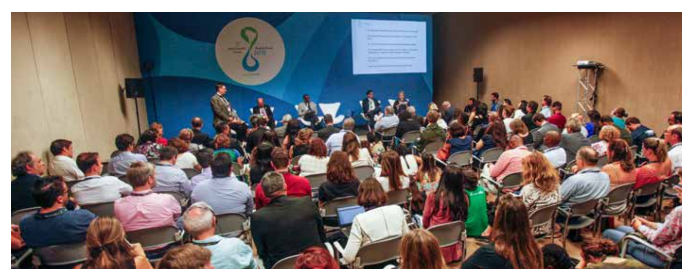
The high-level panel 'Bridging Water and Climate' drew a full room of participants, 19 March.

Climate was one of the nine main themes of the 8th World Water Forum. In addition, a <u>High-Level Panel on Climate</u> highlighted that "water is a common denominator in both the challenges and solutions to design resilient systems."