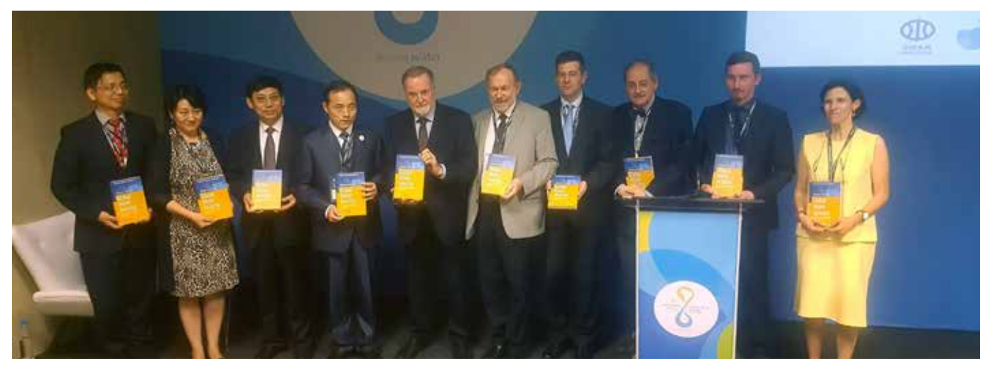
Panelists of the special session on Water Security and the SDGs gather for the launch the book 'Global Water Security', 19 March.

The theme of water security was discussed extensively throughout the Forum in many different forms, but particular attention was given to it during the special session on 'Water Security and the SDGs', where diverse perspectives, challenges and alternatives around water security were proposed.