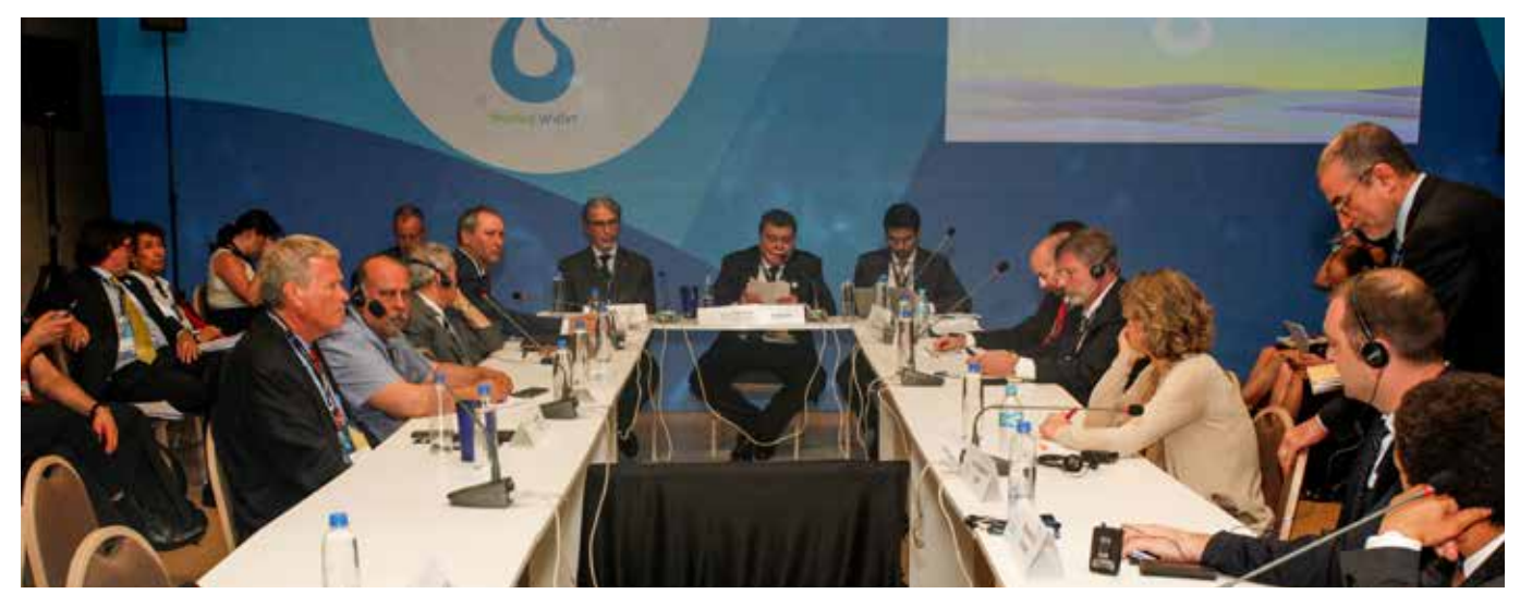
Participants gather for discussions at the Ministerial Roundtable on Climate, moderated by Minister of Environment of Brazil, José Sarney Filho.

The <u>Ministerial Declaration</u>, entitled "An Urgent Call for Decisive Action on Water", was the result of several months of deliberations in the lead-up to the 8<sup>th</sup> World Water Forum. While calling on all countries to take urgent action to tackle water- and sanitation-related challenges, the Ministerial Declaration denotes specific areas in need of constructive changes. These areas include: