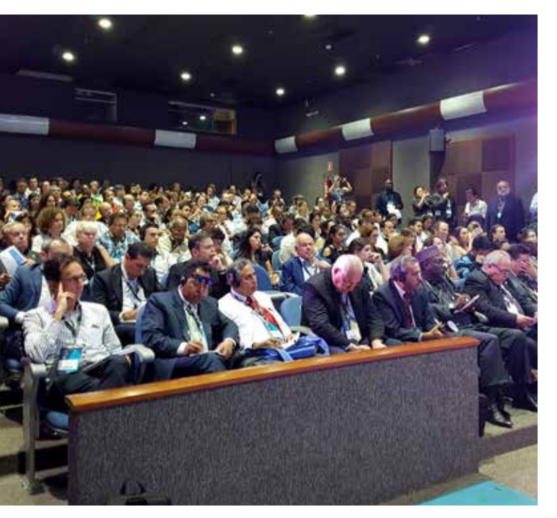
The audience of the high-level panel on Increasing Financial Flows for Sanitation and Wastewater Management, 20 March.

During the 8<sup>th</sup> World Water Forum, an effort to bring more attention to sanitation issues was made through regular and special sessions such as 'Sanitation Services in Small Towns', 'Whole Sanitation Approach, Sanitation Chain, Innovation' and the session on 'Addressing the Sanitation Gap.' It was also discussed during the High-Level Panel on Increasing Financial Flows for Sanitation and Waste Water Management.