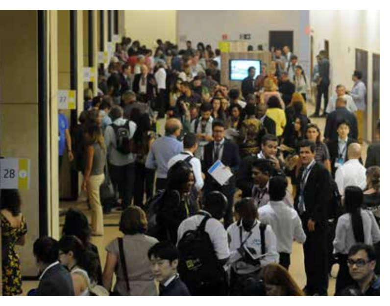
Corridors at the Ulysses Guimarães Convention Center packed with Forum participants attending various sessions.

As one of the core processes of the World Water Forum, the Thematic Process consisted of six main themes – climate, people, development, urban, ecosystems and finance – and three cross-cutting issues – sharing, capacity and governance. Across these nine themes and issues, 32 topics were identified, comprising 95 sessions coordinated by a total of 430 organizations.