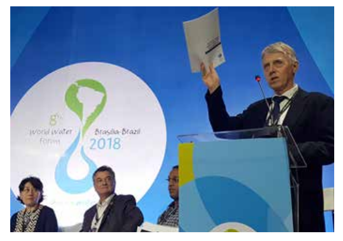
Governor of the World Water Council and Chair of the Thematic Commission for the 8th World Water Forum Torkil Jønch Clausen opens the high-level panel 'Revitalizing IWRM for the 2030 Agenda', 20 March.

The ways in which integrated water resource management (IWRM) can lead to solutions for practical water management problems was discussed during the 8th Forum, especially during the High-Level Panel on Revitalizing IWRM for the 2030 Agenda. The third high-level panel in a series organized over the course of one year, it reiterated that the 2030 Agenda demands IWRM to be transformational, and that IWRM needs to be adaptive and respond to demands from other sectors, while working within the constraints of political realities. The key messages were included in a Challenge Paper published by the World Water Council, entitled "<u>Revitalizing IWRM for the 2030 Agenda</u>".