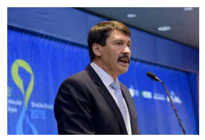
President of Hungary János Áder addressed the high-level panel on Financing Water Infrastructure, 20 March.

o address challenges, it is essential that the key solutions are transmitted from the very top level of the political hierarchy, accompanied by national commitment to work with various stakeholders in order to access additional finance. The Forum was able to do this through the presence of President János Áder of the Republic of Hungary during the High-Level Panel on Financing Water Infrastructure (Roundtable on Financing Water). In addition, greater traction for financing issues was made through the outcomes of the High Level Panel on Water, which comprised 11 sitting heads of state. Another member of the body represented at this session was The Netherlands, whose Special Envoy for Water Affairs, Henk Ovink, highlighted the importance of valuing water. The High Level Panel on Water launched its conclusions in an outcome document named "Making Every Drop Count" just prior to the 8th World Water Forum, which focused on valuing, providing financial means and identifying priorities to scale up financing for water and sustainable growth.