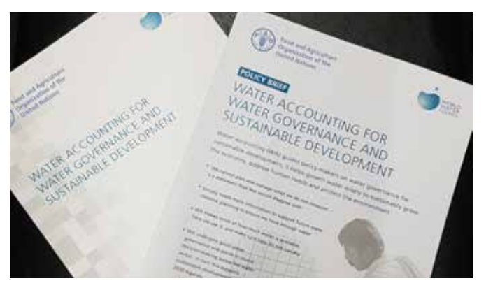
Documents released by the World Water Council and the FAO: "Water accounting for water governance and sustainable development" and "Policy recommendations on water accounting".

Since the majority of global water use goes to supporting agriculture, the Forum recognized the need to highlight this issue through sessions and side events addressing water use in food production and processing, and in particular soil and water conservation practices; waste reduction, optimization and reuse; and agricultural resilience to natural disasters. In addition, High-Level Panels featuring international leaders in the water sector were organized to build awareness for how food security and water reconditioning and reuse as a helpful tool, while underscoring that available technology now allows us to obtain water quality fit for reuse that does not compromise food quality or safety.