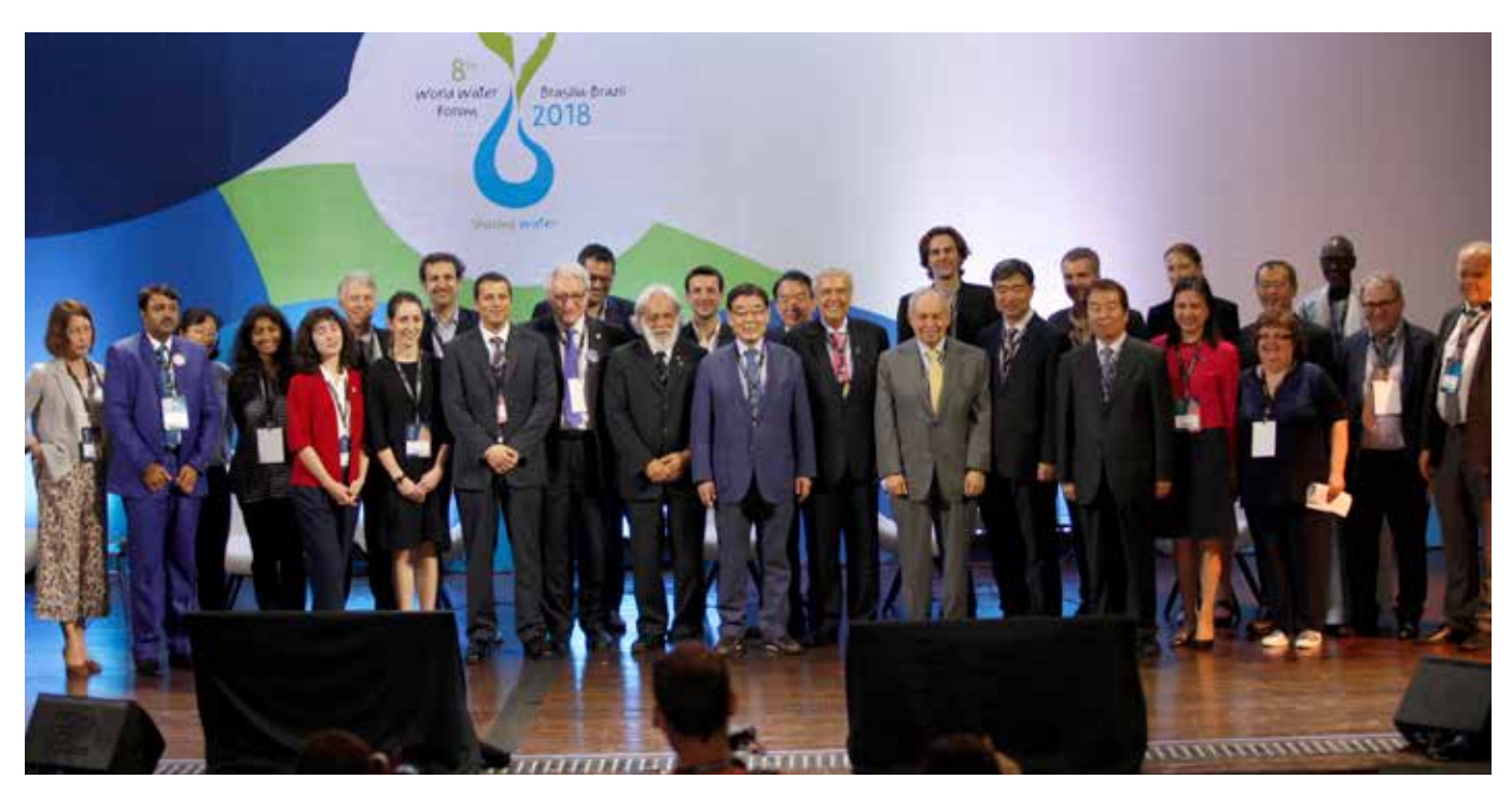
DGIC Champions and Core Group members gather at the 8th World Water Forum after three years of Implementation Roadmaps, 21 March.

special session organized by the World Water Council, in collaboration with the Ministry of Land, Infrastructure and Transport of South Korea and Korea Water Forum (KWF), shared the achievements of the Daegu-Gyeongbuk Implementation Commitment Champions and their core groups over the past three years. Implementation Roadmaps (IRs), as a voluntary tracking mechanism to monitor progress on various waterrelated challenges, aimed to catalyze long-term collective action for water based on objectives identified at the 7th World Water Forum. The IR Synthesis Report was presented during the session and contained both a quantitative and a qualitative analysis of the progress made in each of the 16 IRs. It estimates that 61% of the objectives were completed since the 7th Forum and that 36% are still in progress, totaling a progress of 97%. In addition, 14 policy recommendations were formulated, destined for transmission to the High-Level Political Forum's review of SDG 6.