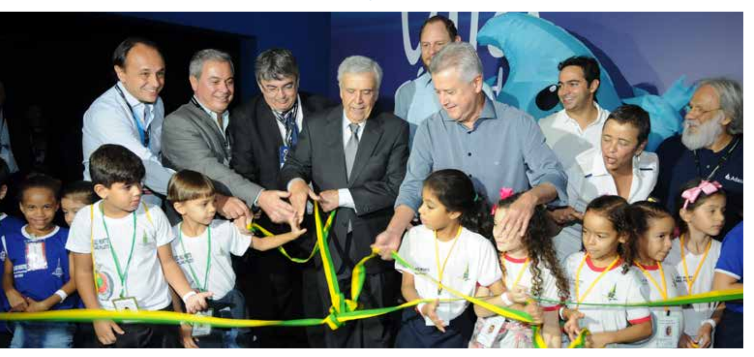
Opening of the Citizens Village, 17 March.

One of the most successful components of the 8<sup>th</sup> World Water Forum, the Citizens Village attracted more than 100,000 visitors during the Forum week and the preceding weekend. In this open, free and democratic space, the audience could engage in activities aimed at sensitizing them to the importance of water and sanitation. Proposing a mix of culture, science, education and recreation, the Citizens Village also attracted school excursions, contributing to a dynamic inter-generational exchange.