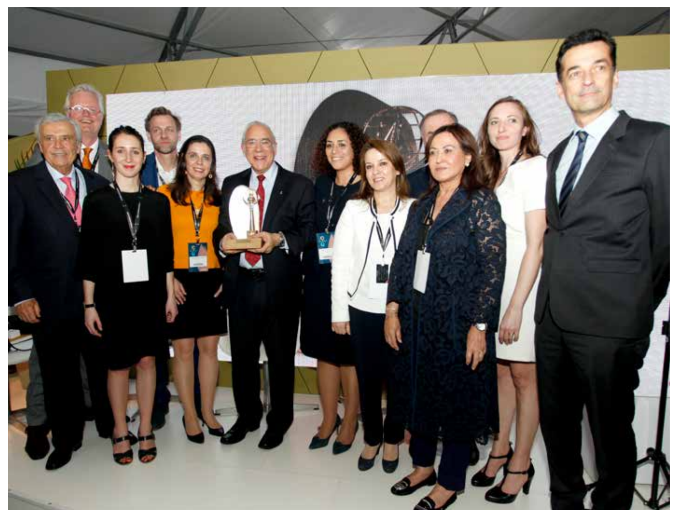
Secretary-General Ángel Gurría accepts the Hassan II Great World Water Prize on behalf of the OECD in the presence of Morocco's Minister Delegate to the Minister of Energy, Mines, Water and Environment in charge of water Charafat Afailal, 21 March.

As one of the highest distinctions in the water sector, the King Hassan II Great World Water Prize attracted significant attention at the 8<sup>th</sup> World Water Forum. Presented in its 6<sup>th</sup> edition to recognize "cooperation and sound management in the development and use of water resources", the prize was awarded to OECD. The King Hassan Prize and its winner OECD