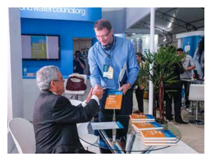
World Water Council President Benedito Braga during a signing session for the book 'Global Water Security', 19 March.

with the Ministry of Water Resources of the People's Republic of China. By showcasing the diversity of issues plaguing countries in different regions, the book reflects the spatial, temporal and cultural variability of water security.