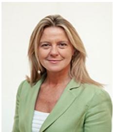
Ms Beatrice LORENZIN