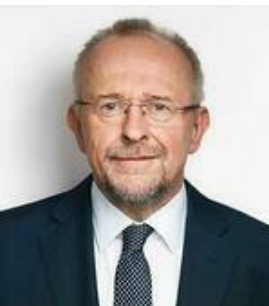
Mr Axel SCHÄFER Member Committee on the Affairs of the European Union