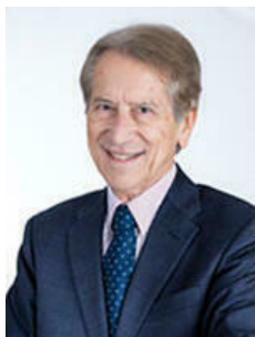
Mr Giulio TERZI DI SANT'AGATA Head of Delegation Chair European Union policies Committee