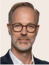
Mr Sebastian FIEDLER Head of Delegation Member Committee on Internal Affairs and Community SPD - S&D