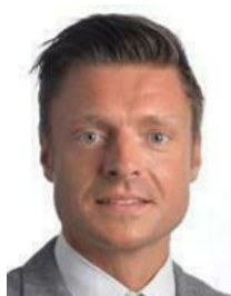
Mr Koen METSU Head of Delegation Vice- Chair Committee on Interior Affairs