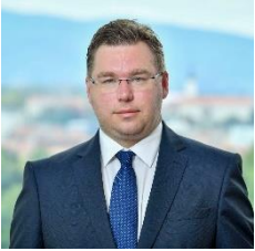
Mr Marko PAVIĆ

Chair, Committee on Regional Development and EU Funds