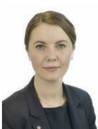
Ms Ida KARKIAINEN Head of Delegation Chair, Committee on the Constitution