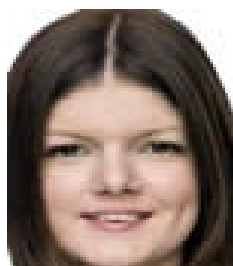
Ms Kathleen FUNCHION

Chair, Committee on Children, Equality, Disability, Integration and Youth