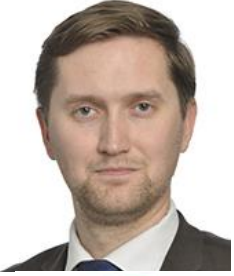
Mr Jaak MADISON (ET)