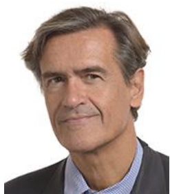
Mr Juan Fernando LÓPEZ AGUILAR (ES)