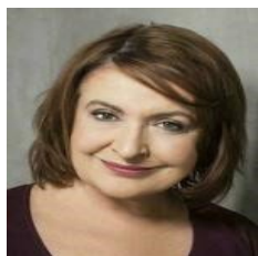
Ms Miluše HORSKÁ