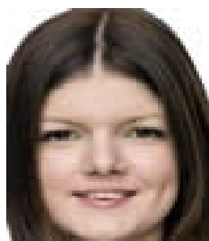
Ms Kathleen FUNCHION

Chair, Committee on Children, Equality, Disability, Integration and Youth