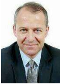
Mr Jean-François HUSSON Rapporteur général, Committee on Finances