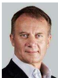
Mr László VARJU Chair, Committee on the Budget