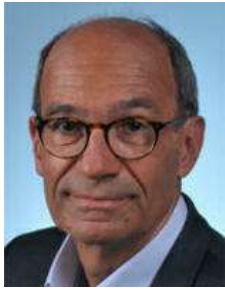
Mr Éric WOERTH Head of Delegation Chair, Committee on Finances