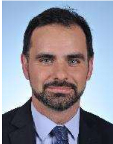
Mr Laurent SAINT-MARTIN Rapporteur général, Committee on Finances