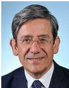
Mr Charles DE COURSON Vice-chair, Committee on Finances