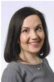
Ms Sanni GRAHN-LAASONEN Chair, Commerce Committee