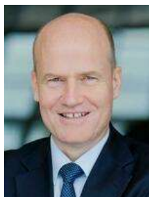
Mr Ralph BRINKHAUS Committee on European Union Affairs

AfD-Fraktion - Identity and Democracy Group