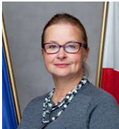
Ms Danuta JAZŁOWIECKA Vice-Chair, Committee on Foreign and European Union Affairs Civic Platform - EPP