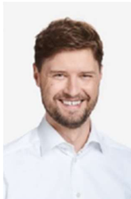
Mr Mykolas MAJAUSKAS Head of Delegation Committee on European Affairs

Homeland Union - Lithuanian Christian Democrat Political Group - EPP