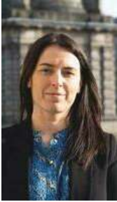
Ms Lynn RUANE Member, Committee on Justice