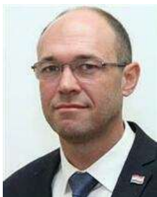
Mr Davor Ivo STIER Member, Committee on Foreign Affairs