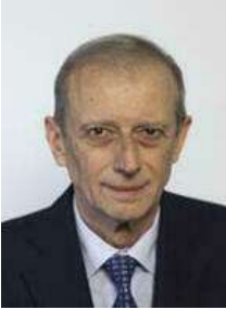
Mr Piero FASSINO

Chair, Committee on Foreign and European Affairs