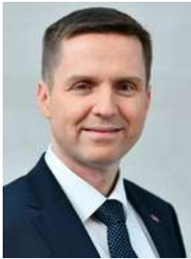
Mr Igor ZORČIČ President of the National Assembly Head of Delegation