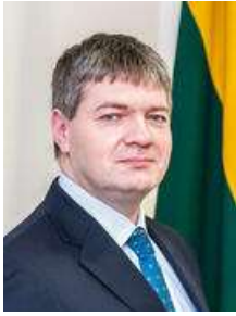
Mr Andrius MAZURONIS Member, Committee on National Security and Defence