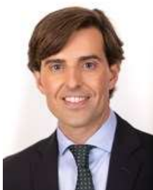
Mr Pablo MONTESINOS

First Vice President of the Home Affairs Committee