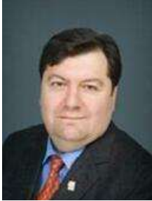
Mr Emanuelis ZINGERIS Member, Committee on Foreign Affairs