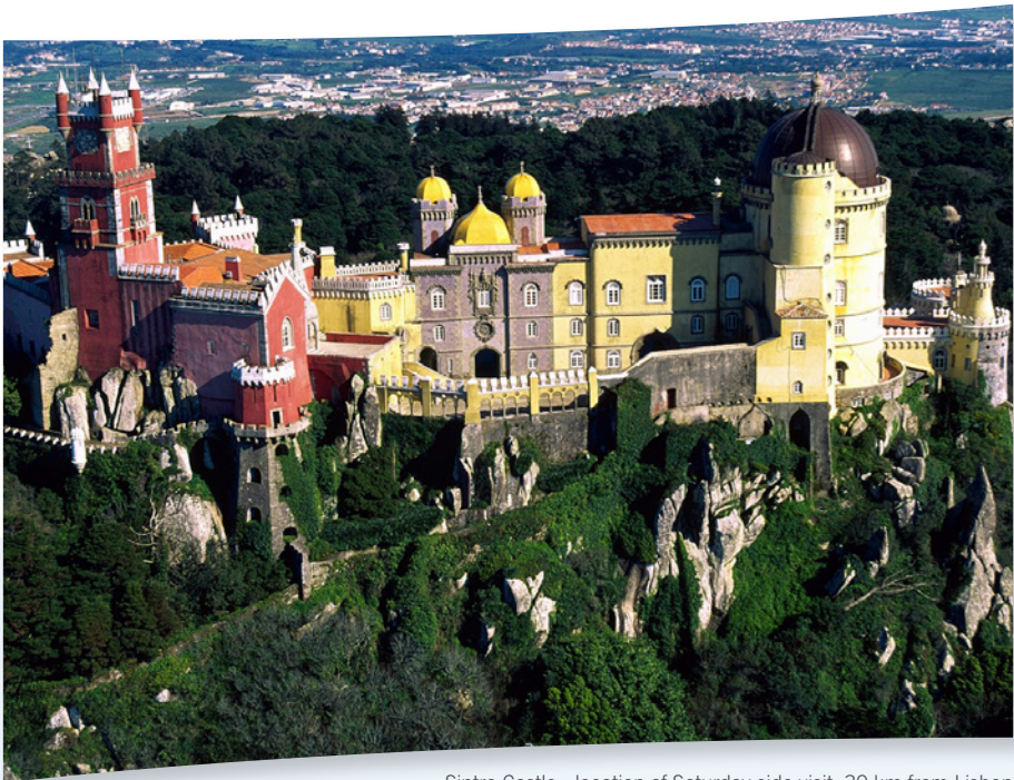
Sintra Castle - location of Saturday side visit, 30 km from Lisbon

21:00 Bus to Lisbon, two stops: Lapa Palace Hotel and Lisbon Centre