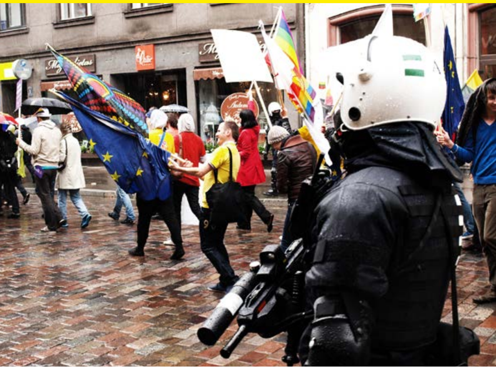
Baltic Price, Riga, Latvia, May 2012