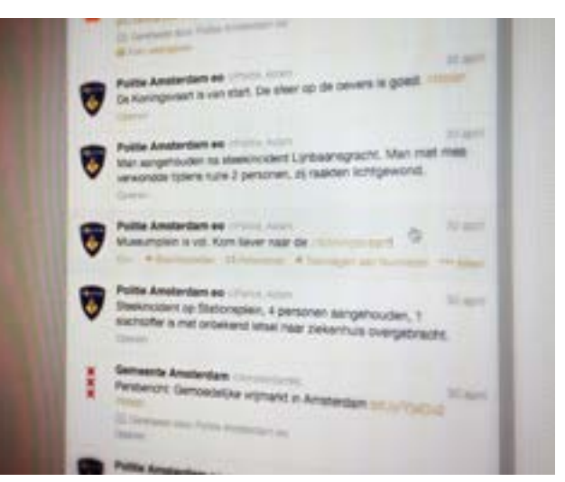
Amsterdam police website informing on a public order situation, Netherlands, April 2013

Cyprus, Denmark, Greece, the Netherlands, Poland, UK, and the USA. While important challenges remain to be solved, police officers involved in communication through social media have said that the most important lesson learned is that police cannot afford not to use them, and many of them have started to develop policies on how they can use these media: e.g. for informing the public about assemblies that are going to take place, advising them on traffic and safety issues, dispelling rumours, calling for peaceful conduct etc. Some have even started to have a presence on the web sites of organizers, to ensure that such information is communicated to participants.