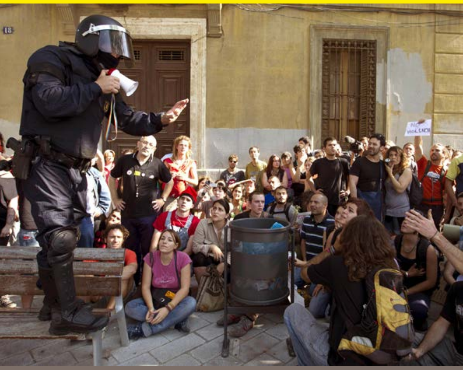
Police officer communicating with demonstrators in front of the Parliament in Catalonia, Barcelona, Spain, June 2011