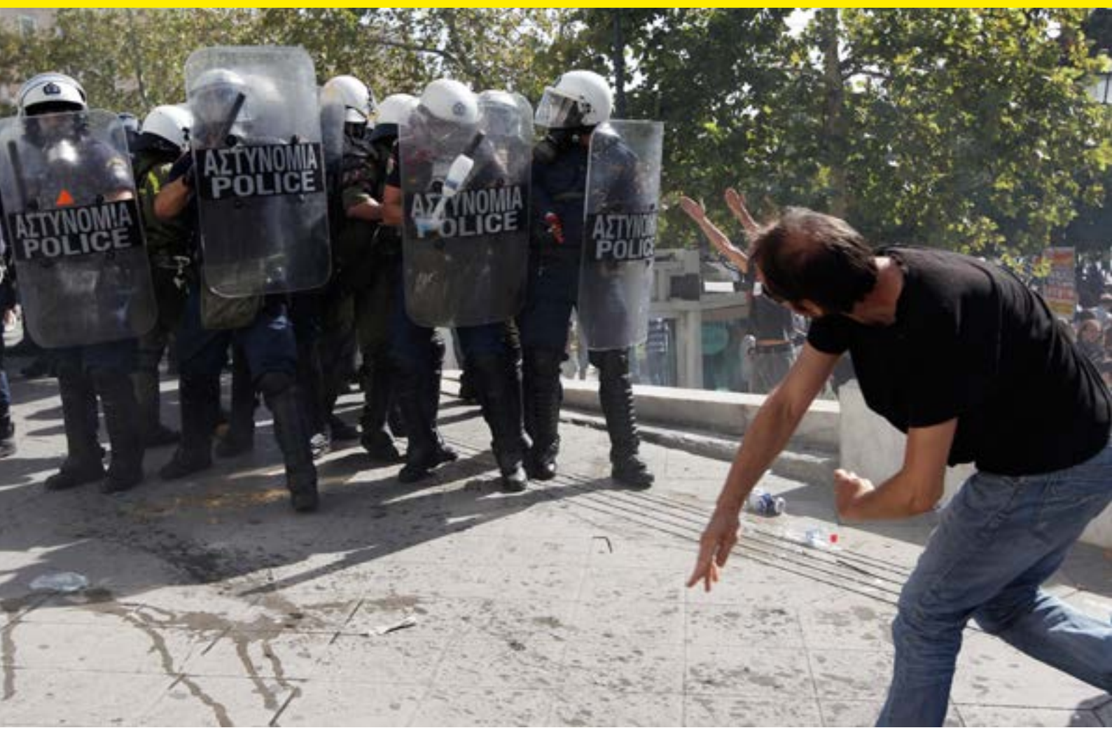
Protestor throwing a bottle at police, Athens, Greece 2012