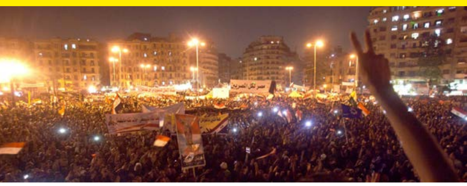
Large demonstration at Tahrir Square, Cairo, Egypt, November 2012

timeframe set by the overall speed of social media, given that police must ensure that their reaction is accurate based on confirmed information.