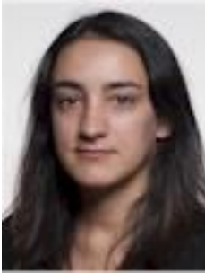
Ms Isabel PIRES European Affairs Committee BE - GUE/NGL