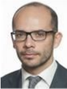
Mr Manuel RODRIGUES European Affairs Committee PSD - EPP