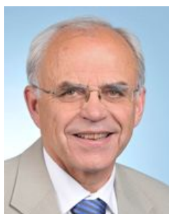
Mr Marc LAFFINEUR European Affairs Committee Les Républicains - EPP