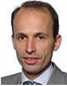
Mr Pedro MOTA SOARES European Affairs Committee CDS-PP - EPP