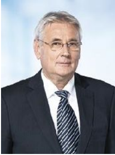
Mr Mátyás FIRTL European Affairs Committee Christian-Democratic People's Party - EPP