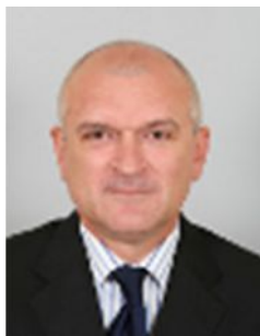
Mr Dimitar GLAVCHEV

Vice-Chair, Budget and Finance Committee PP GERB - EPP