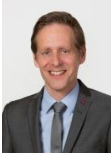
Mr Kai Jan KRAINER Vice-Chair, Finance Committee Social Democratic Party - S&D