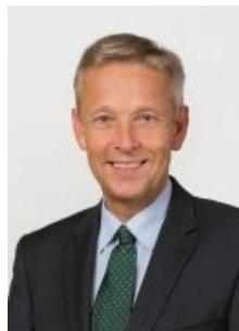
Mr Reinhold LOPATKA Finance Committee Austrian People's Party - EPP