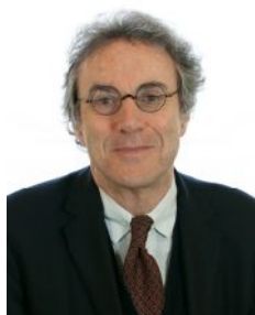
Mr Paolo GUERRIERI PALEOTTI EU policies Committee Partito Democratico - S&D