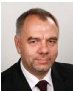
Mr Jacek SASIN