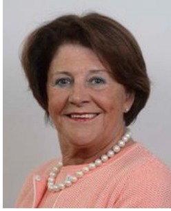
Ms Ria OOMEN-RUIJTEN European Affairs Committee CDA - EPP