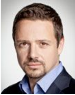
Mr Rafał TRZASKOWSKI Vice-Chair, European Affairs Committee Civic Platform - EPP