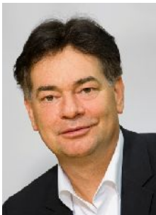
Mr Werner KOGLER Finance Committee Greens - Greens/EFA