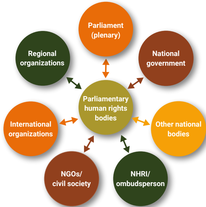
Figure 2. Range of stakeholders engaging with parliamentary human rights bodies

National Human Rights Institutions play an important role as rule of law safeguards and can provide an independent check on the system in a rule of law crisis. (European Commission 2020a: 23; see also FRA 2020; PACE 2014)