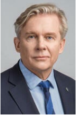
Mr Audronius AZUBALIS Vice-Chair, Committee on European Affairs

Homeland Union - Lithuanian Christian Democrats - EPP