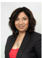
Ms Selma YILDIRIM Vice-chair, Judiciary Committee Austrian Social Democratic Party - S&D