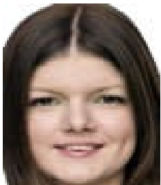
Ms Kathleen FUNCHION

Chair, Committee on Children, Equality, Disability, Integration and Youth