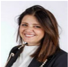
Ms Daniela TERNULLO

Member, Committee on Constitutional Affairs, Prime Ministerial and Home Affairs, General Organisation of the State and the Civil Service, Publishing Industry, Digitization