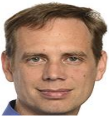
Mr Patrick BREYER (DE)