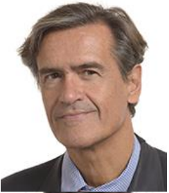
Mr Juan Fernando LÓPEZ AGUILAR (ES)