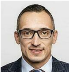
Mr Jaroslav BŽOCH Head of Delegation Vice- Chair Committee on European Affairs Ano 2011 - RENEW