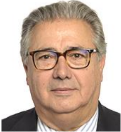
Mr Juan Ignacio ZOIDO (ES)