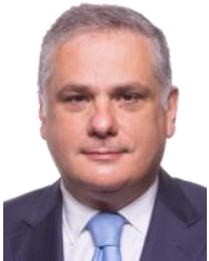
Mr Jorge SEGURO SANCHES Member Committee on European Affairs PS - S&D