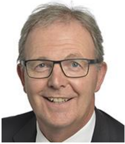
Mr Axel VOSS (DE)