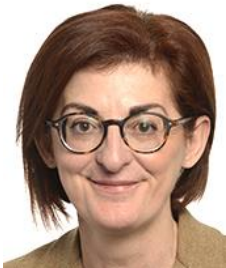
Ms Maité PAGA ZAURTUNDÚA (ES)