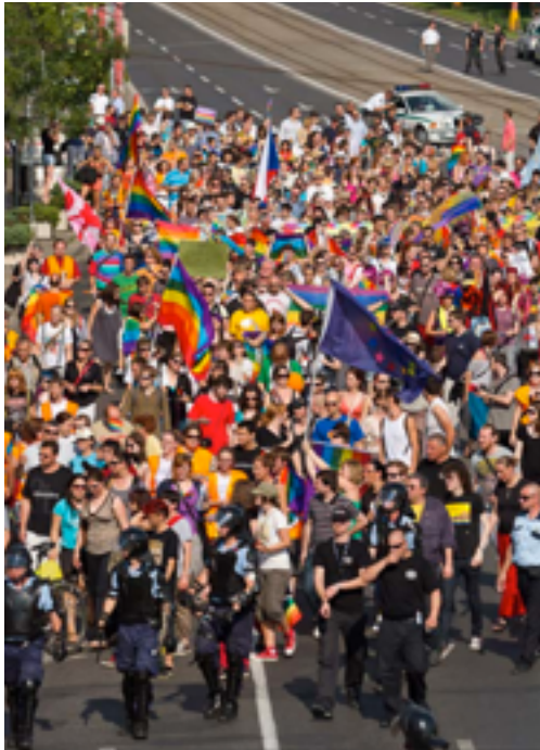
Rainbow Pride Parade Bratislava (Slovakia), 2011.

Pride marches are examples of occasions when police are under the obligation to protect, not only during the march itself, but as well before and after the event. Failure to effectively protect Pride events can sometimes be a result of negative attitudes of police and police management. When a bus with Pride participants was attacked in Moldova in 2008, for example, the police did not interfere, according to the Ministry of Interior to avoid being seen as “gay friendly”. 59 In 2014 and 2015, however, Moldovan police were very efficient in protecting the participants from counter protestors with heavy presence, efficient equipment and actions. 60