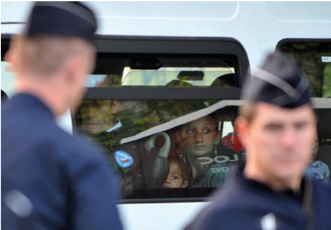
Deportation of Roma from France, 2010.

Discriminatory behaviour by law enforcement officials can be caused by a variety of factors. In some cases, a lack of adequate legislation or procedures certainly plays a role in how the police interact with members of minority groups. However, such legal or procedural gaps cannot justify discriminatory conduct. And often they are not the (sole) reason for police acting in a certain way. In many cases, discriminatory actions can be traced back to a stereotyped attitude or a lack of knowledge of how to interact with certain groups, in particular relating to cultural or linguistic differences, and/or unfamiliarity with their needs or behaviour. It might also be caused by a wrong perception, based on personal experience or prejudice, of certain groups as a threat which leads to a response which has not been consciously thought out. Such biased attitudes are often not unique to individual officers, but are seemingly shared by a large number or sometimes even the majority of officers.