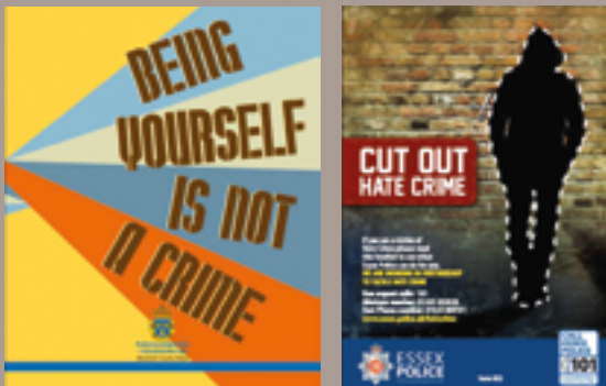
“Cut Out Hate Crime” leaflet of the Essex Police (United Kingdom), Form HC2, 2012, and the “Being yourself is not a Crime” leaflet of Stockholm County Police (Sweden), n.d. Screenshots taken in February 2016.

A number of law enforcement agencies have reached out to victims, by means of leaflets, to encourage reporting. 76