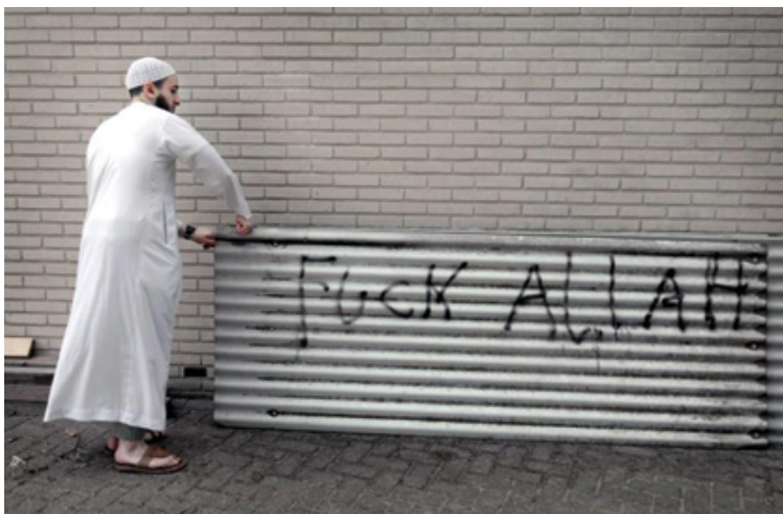
Board member of the Al Muhsinin mosque in Haarlem (The Netherlands) moves a corrugated sheet which has “Fuck Allah” written onto it, 2007.

There is no universally accepted definition of a “hate crime”. Amnesty International generally understands the term to apply to acts against people or property, which are crimes under domestic law (and whose criminalization is consistent with international human rights law and standards), where the victim or target of the offence is selected because of their real or perceived connection to or membership in a group defined by a protected ground, including, but not limited to: race, ethnicity, language, national or social origin, sex/gender, indigenous status, descent, religion or belief, immigration status, disability, sexual orientation or gender identity. 50