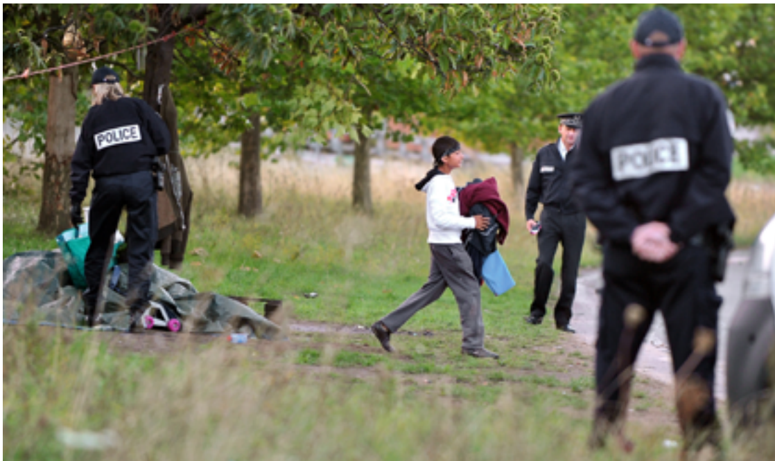
Police and member of the Roma community in France, 2010.

In order to address discriminatory police behaviour effectively and develop targeted measures to counter the problem, it is first necessary to identify what are the issues at hand. In many cases, however, comprehensive data on discriminatory police practices is absent. There are a variety of reasons for this and probably involves a combination of different factors, such as a lack of recording procedures, refusal by police to admit certain practices and the absence of statistical data collection systems. Further, as will be discussed in more detail in the following sections, incidents are commonly underreported as members of minority groups are often reluctant to approach the police or complain about police behaviour. Available data can thus only be considered to be the tip of the iceberg. This can make it difficult to capture and comprehend the full extent of the issues at hand, and might be used by police as an argument that discrimination is not an issue, or is limited to isolated incidents.