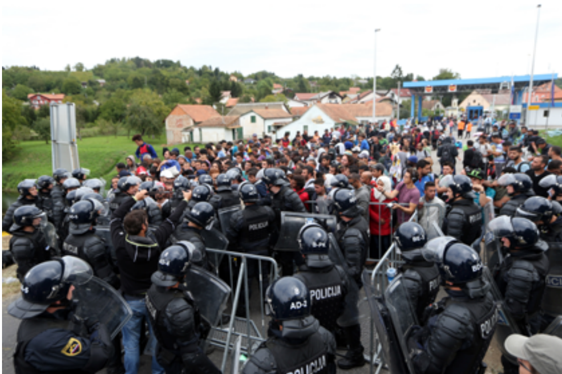
Slovenian police and migrants at the Slovenia-Croatia border in Rigonce (Slovenia), 2015.

Border police, should have clearly established criteria on how and when force can legitimately be used, including during return operations.