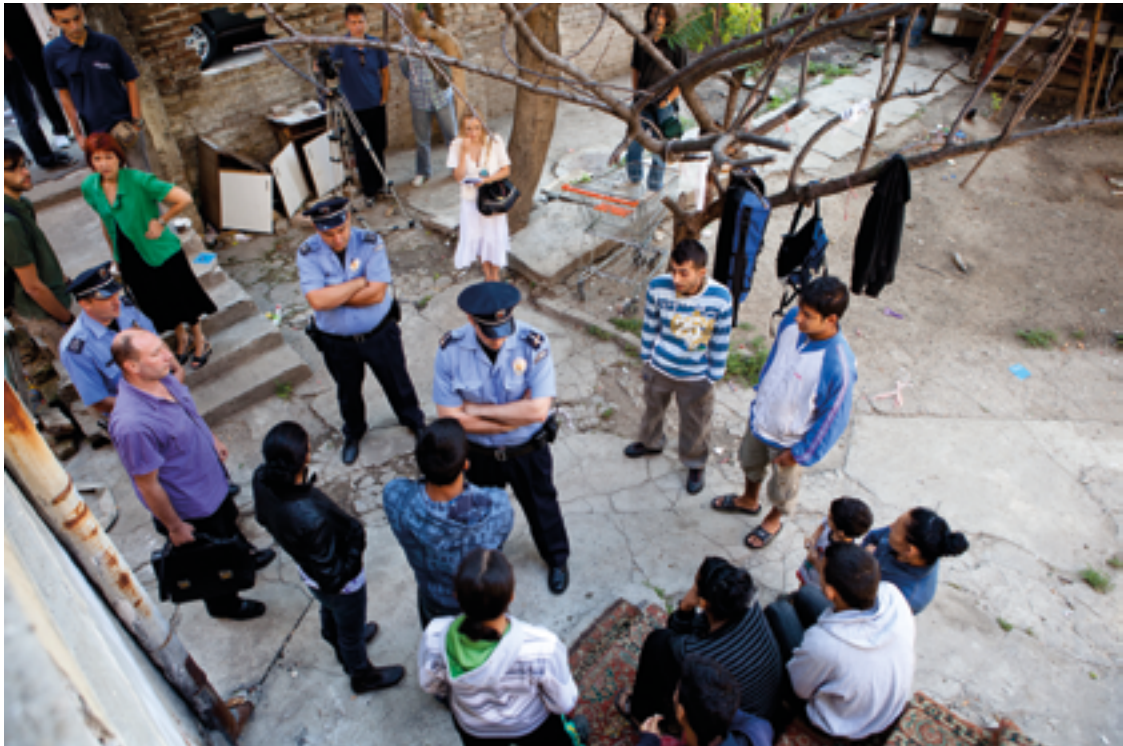
Roma and police during a forced eviction in Belgrade (Serbia), 2011.

The Procedure further includes a “Guide to Gypsy and Traveller Customs” consisting of a list of considerations that police officers should keep in mind during interactions with members of these communities. It should be stressed that all such guidance should be drafted with full and effective participation of community representatives.