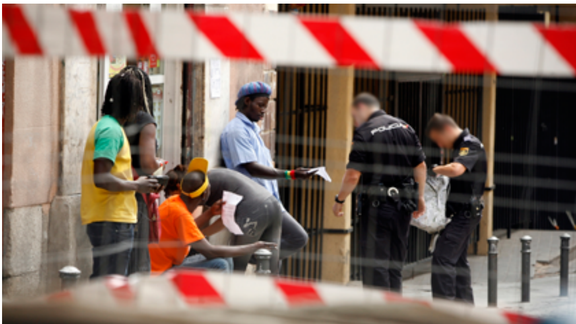
Police officers check documents of men belonging to ethnic minorities in the neighbourhood of Lavapiés, Madrid (Spain), 2010.