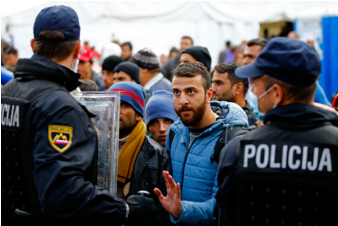
Migrant talking to Slovenian police officers at the exit of a makeshift camp near the Austrian border, 2015.

Besides violating the rights of the individuals at hand in the specific situation, the effect that incidents of heavy handed policing and excessive or unnecessary use of force have on members of minority groups and their communities can be more extensively damaging, by deepening the mistrust in and enmity towards the law enforcement agency that the affected communities may already have as a result of negative experiences in the past. 135