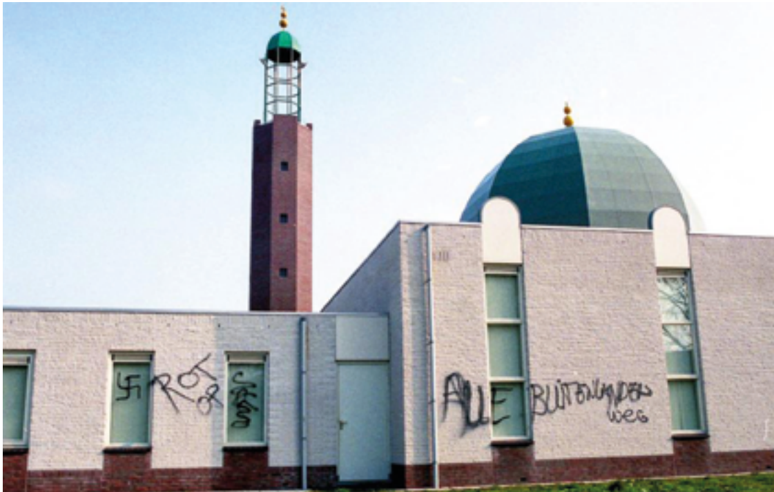
Racist slurs on the walls of a mosque in the Netherlands, 1992.

Any incident with a potential discriminatory motivation should prompt a thorough and effective investigation with a focus on uncovering the underlying motive. In practice, however, hate crimes are often not appropriately recorded and investigated by police. As pointed out by Amnesty International research, for instance on Bulgaria, hate crimes are often not registered and the authorities regularly fail to launch an investigation. When an incident is investigated, the discriminatory motive is often not taken into account, and the incident is processed as the offence of hooliganism instead. Reasons for this might be that the evidence required to establish hooliganism is easier to obtain, and that hate crime laws are relatively new with officials lacking experience and training in the matter. 84 Similarly in Ukraine, police are reluctant to investigate homophobic or transphobic hate crimes as such, and incidents are often processed either as ordinary crimes or as hooliganism without considering the underlying motive. 85 The investigation opened after the 2015 Kyiv Pride, for example, qualified the violence that occurred during the event as hooliganism. 86