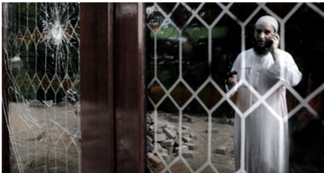
Board member of the Al Muhsinin mosque in Haarlem (The Netherlands) in front of a smashed window at the mosque, 2007.

Once a potential hate crime is reported, the victim should be afforded all necessary information about available support services, as well as regular updates on the status of the investigation and adequate protection if necessary.