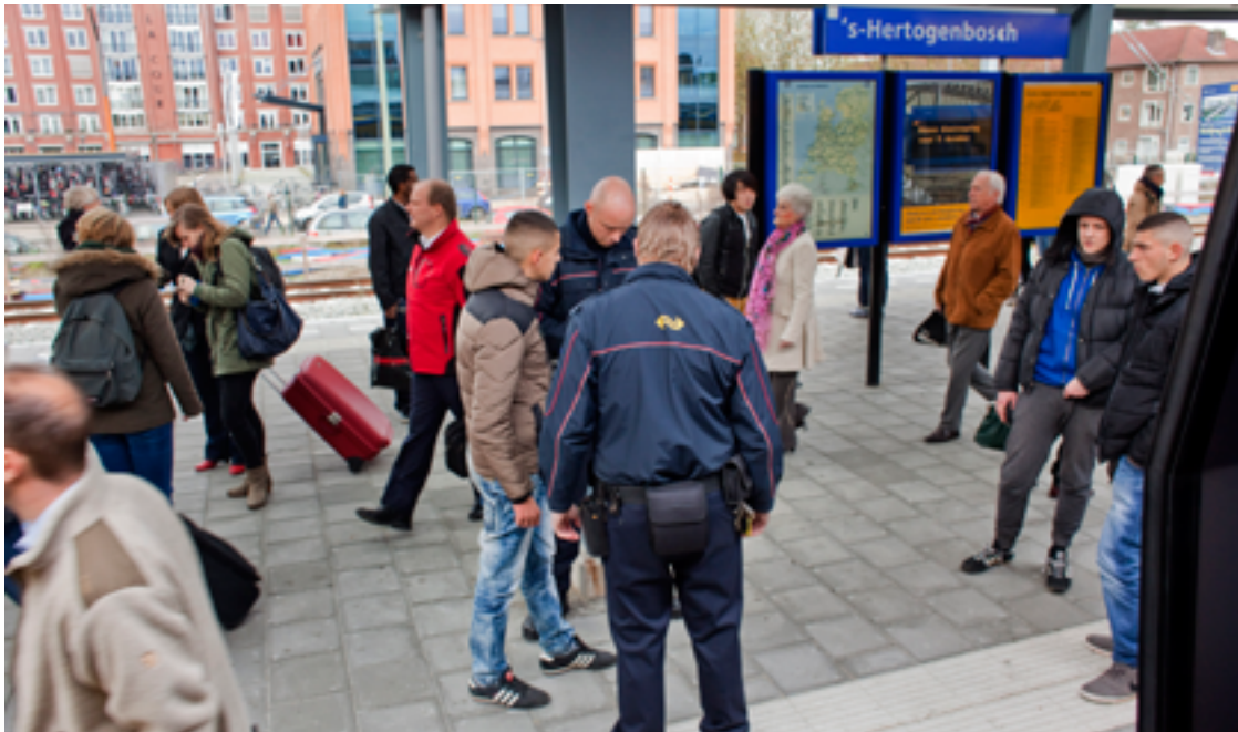
Police checking the identity documents of a person of Arabic appearance at the train station of 's-Hertogenbosch (The Netherlands), 2013.

The “Best Use of Stop and Search Scheme”, to which every police agency in England and Wales has committed itself, introduces various measures to increase transparency and community involvement in stops and searches. Besides detailed recording of stops, the scheme also introduces ‘lay observation’, which provides members of the public with the possibility to accompany police officers to observe stops and searches and provide feedback to the officers. It further requires forces to adopt a complaint policy that requires police to explain to local community scrutiny groups how they use their powers, in case of a large number of complaints and/or of particularly serious complaints. 121