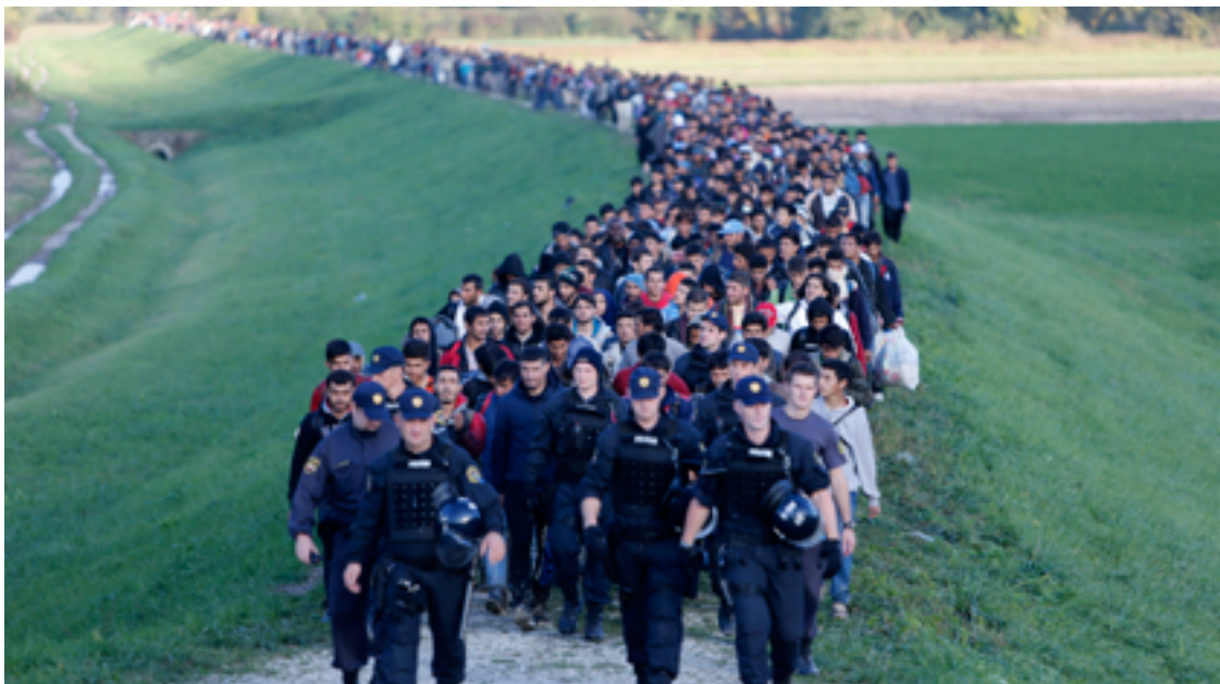
Migrants are escorted by police as they make their way on foot on the outskirts of Brezice, Slovenia, 2015.

As was pointed out by the European Ombudsman, the provisions on the use of coercive measures should further include a requirement that the use of coercive measures should take appropriate account of the individual circumstances of each person such as their vulnerable condition. 147