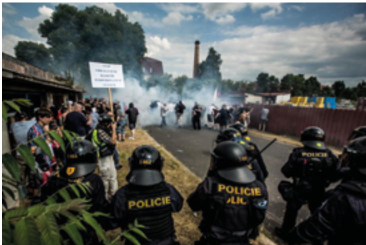
Police in the Czech Republic push back participants of a hate march after they attacked to enter an area where many Roma families live, n.d.

Police agencies have a duty to protect members of minority groups against hate crimes. In order to offer effective protection, it is important that police take any threats or indications of violence seriously. As was pointed out by Amnesty International research on Poland, for instance, police in some cases only acted effectively once violence escalated, instead of taking measures after the initial attacks and threats. 58