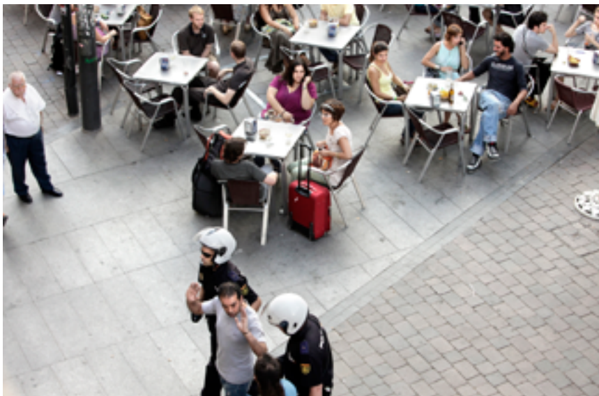
Police arrest a migrant in the square of Tirso de Molina in Madrid (Spain), 2010.

The Swedish Aliens Act, for example, provides that a person cannot be stopped or checked solely on account of his or her skin colour, name, language or other similar characteristic. 112