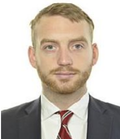
Mr Jakob DALUNDE

Committee on Justice The Green Party - Greens/EFA