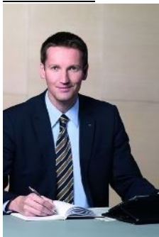
Mr Patrick SENSBURG

Chair, NSA Inquiry Committee CDU-CSU - EPP