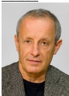
Mr Peter PILZ

Standing Subcommittee of the Interior Affairs Committee Die Grünen - Greens/EFA