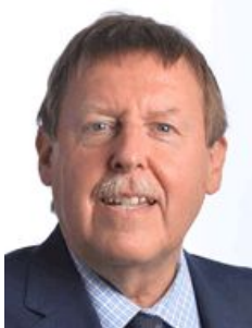
Mr Siegfried BRACKE

Chair, Parliamentary Committee for the Oversight of Intelligence and Security Services N-VA - ECR