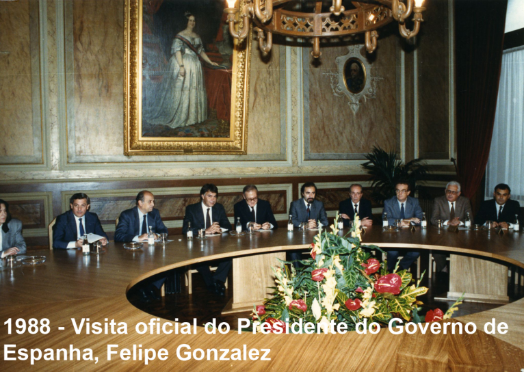
1988 - Visita oficial do Presidente do Governo de Espanha, Felipe Gonzalez